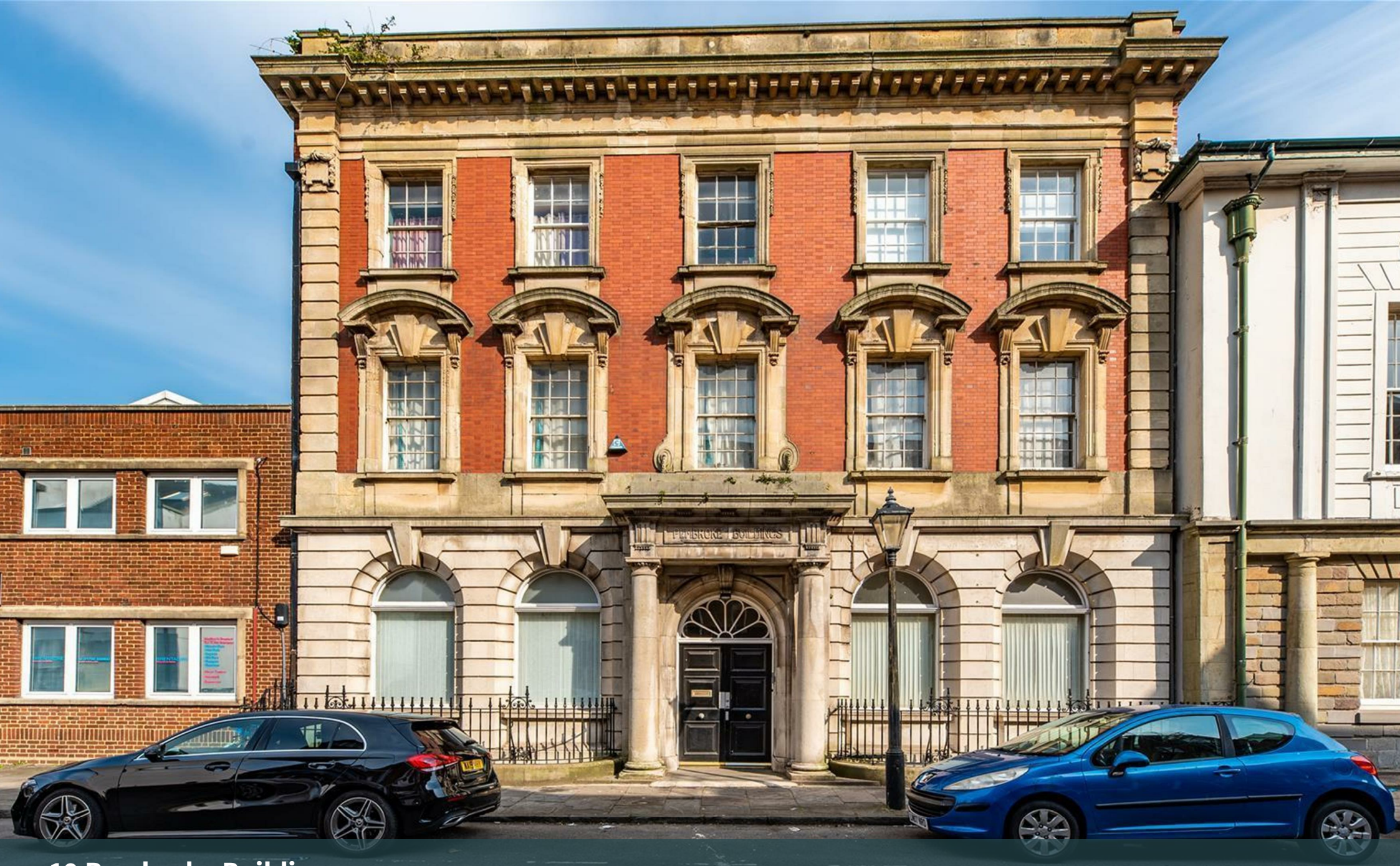
19 Pembroke Buildings Pier Street, Swansea, SA1 1RY £600 PCM